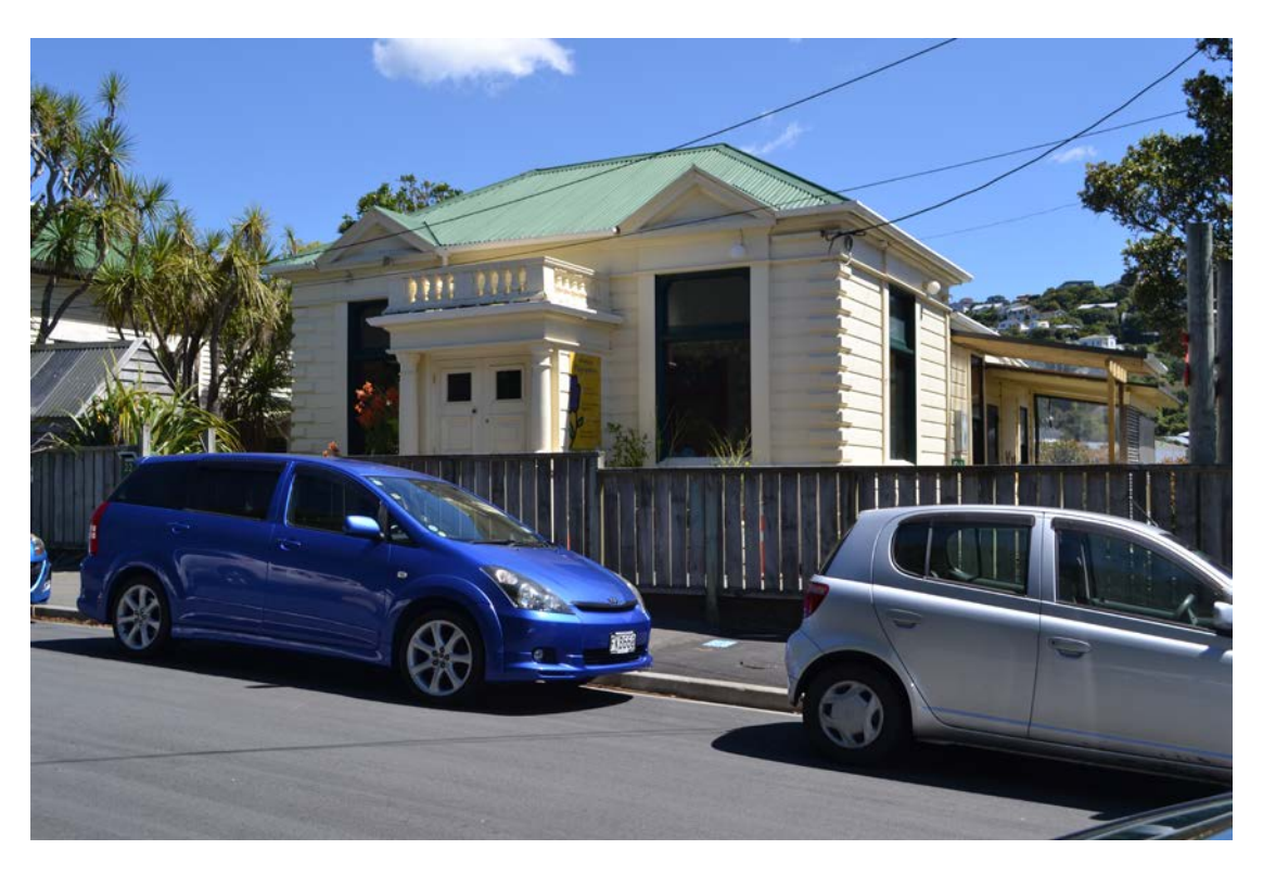
Former Brooklyn Library / Brooklyn Playcentre (2011).