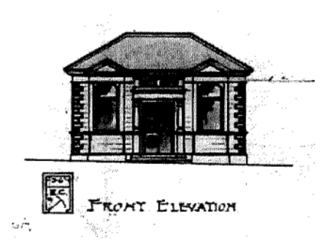
1904 proposed elevation