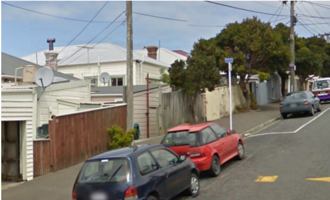
57, 59, 61 & 63 Wright Street.