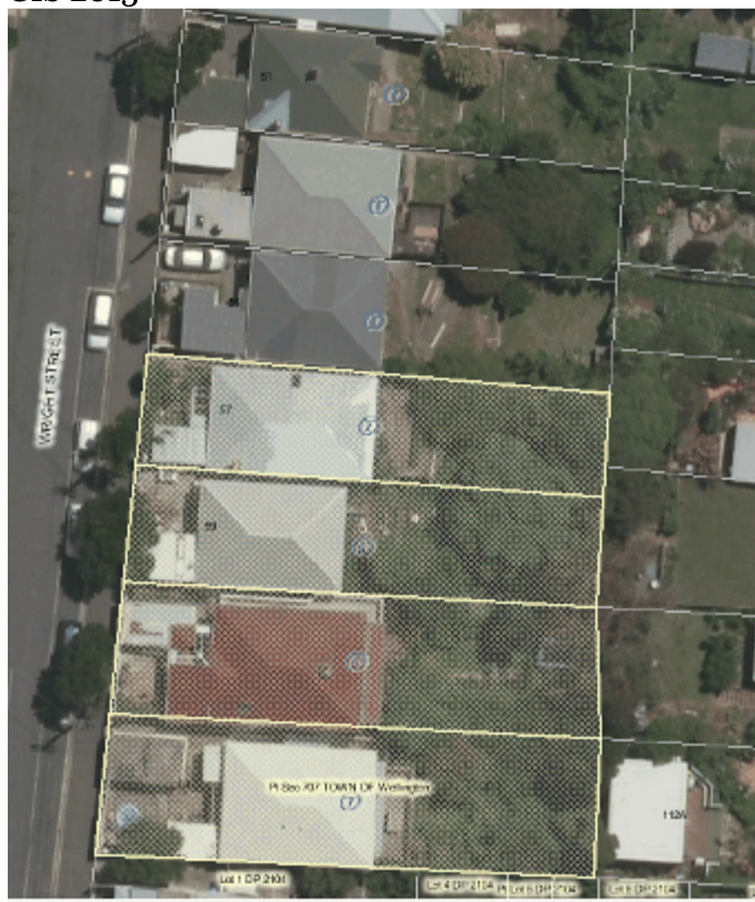
House No. 57