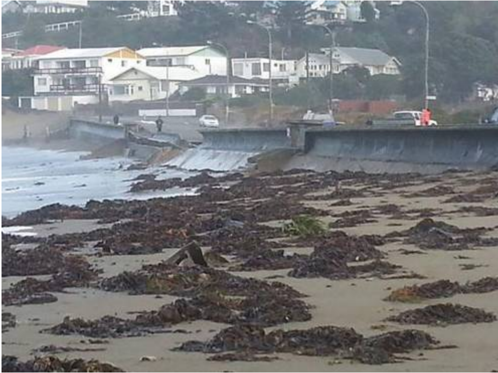
Damage to the Island Bay Seawall (Western/Central section of the Island Bay Beach) following June 2013 storm. 1