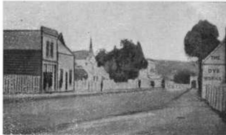
Fig. 77.—Cuba Street in the 'seventies. Barber's dye works to the right. The Nag's Head and Wesleyan Church in the distance, to the left.

Fig. 77.—Cuba Street in the 'seventies. Barber's dye works to the right. The Nag's Head and Wesleyan Church in the distance, to the left. Figs. 76 and 77 by courtesy "Evening Post." (Cyclopedia of NZ website http://nzetc.victoria.ac.nz/tm/scholarly/WarEarl-fig-WarEarl219c.html )