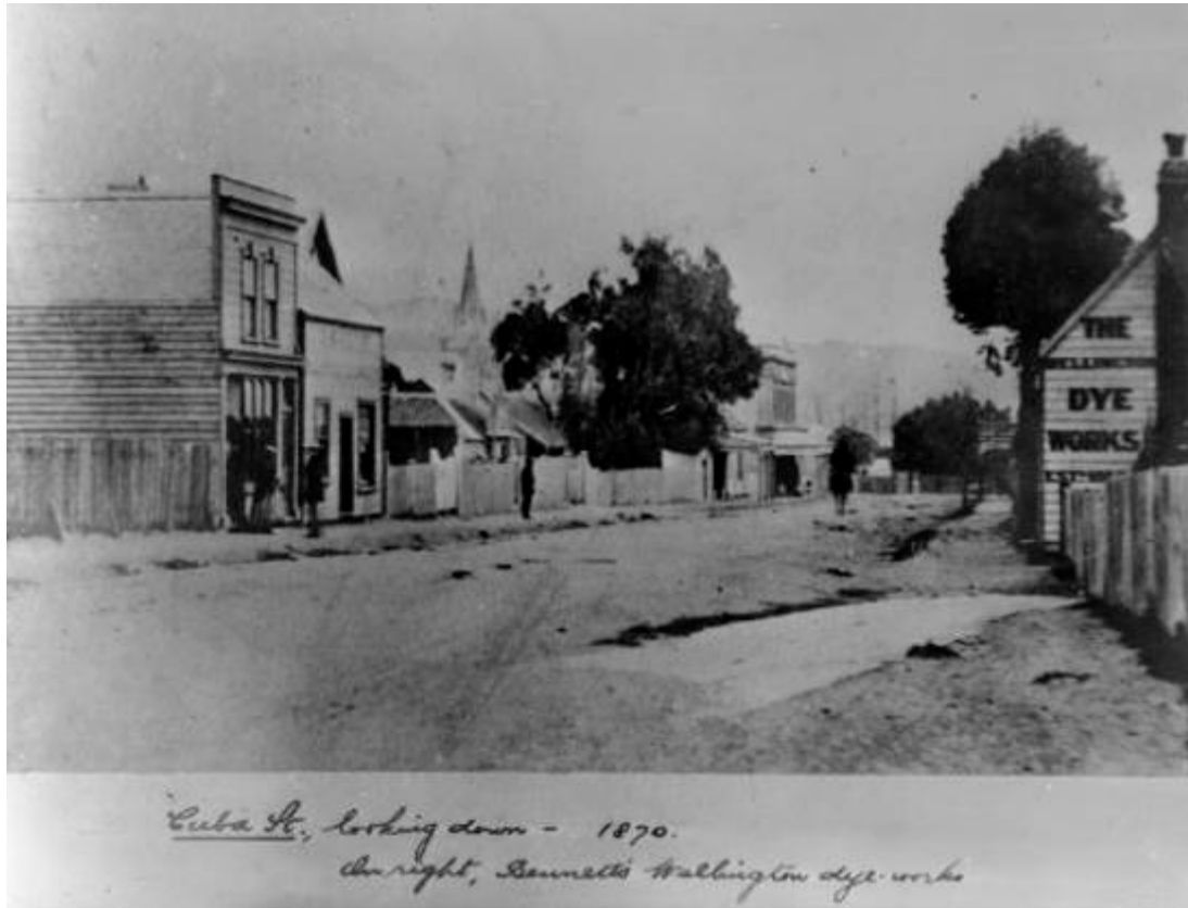
Looking along Cuba Street, Wellington, in 1870. Shows the Wellington Dye Works on the right. The Nag's Head and Wesleyan Church in the distance, to the left.