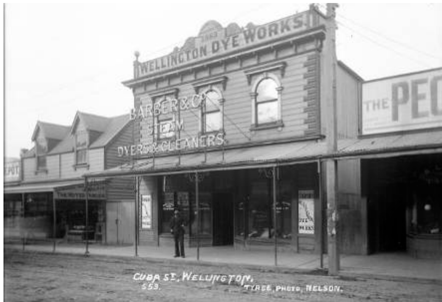
Cuba Street, Wellington, circa 1896, showing the premises of Barber & Co, Steam Dyers and Cleaners at no. 46. The sign painted on the top of the building reads "Established 1863. Wellington Dye Works". On the left, at no. 42, is the business of `J Walker - The noted fancier' (a bird shop). To the right, at no. 48a, just out of the picture, is the shop of Arthur Lilley, tailor. Photograph taken by the Tyree Brothers, circa 1890 (ATL 1/2-011651-G)