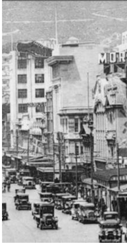
Looking southeast along Courtenay Place. The National Bank is the central building with the distinctive cornice, c. late 1920s/early 1930s.