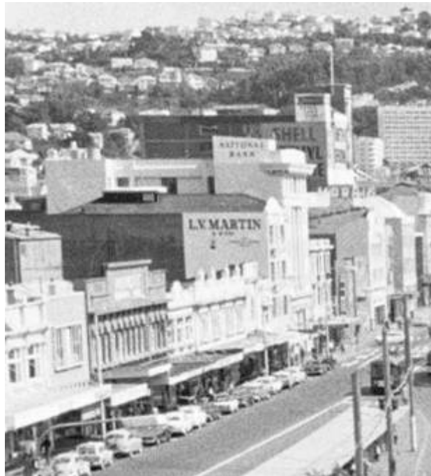
The National Bank Building with its signage visible, 1968. (EP/1968/1133/9-F, Evening Post Collection, Alexander Turnbull Library)