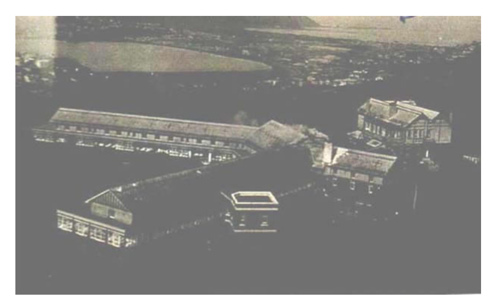
Photograph showing the hospital in 1926

Wellington City Council work at the site structurally upgrading the building is continuing, this will be followed by interior fit-out by the Wellington SPCA. Work in 2013 is ongoing.